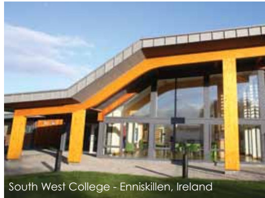
South West College - Enniskillen, Ireland