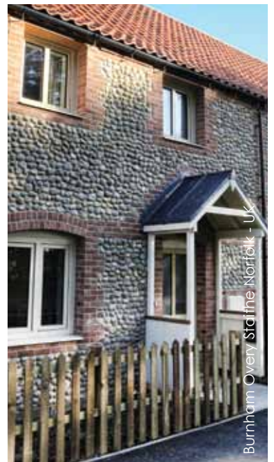
Burnham Overy Stidfine Norfolk - UK