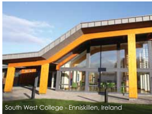
South West College - Enniskillen, Ireland